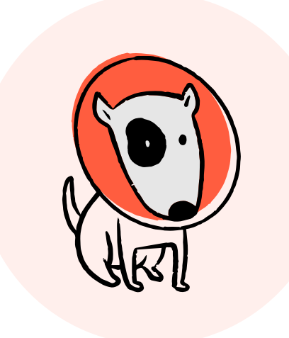
Store & Service